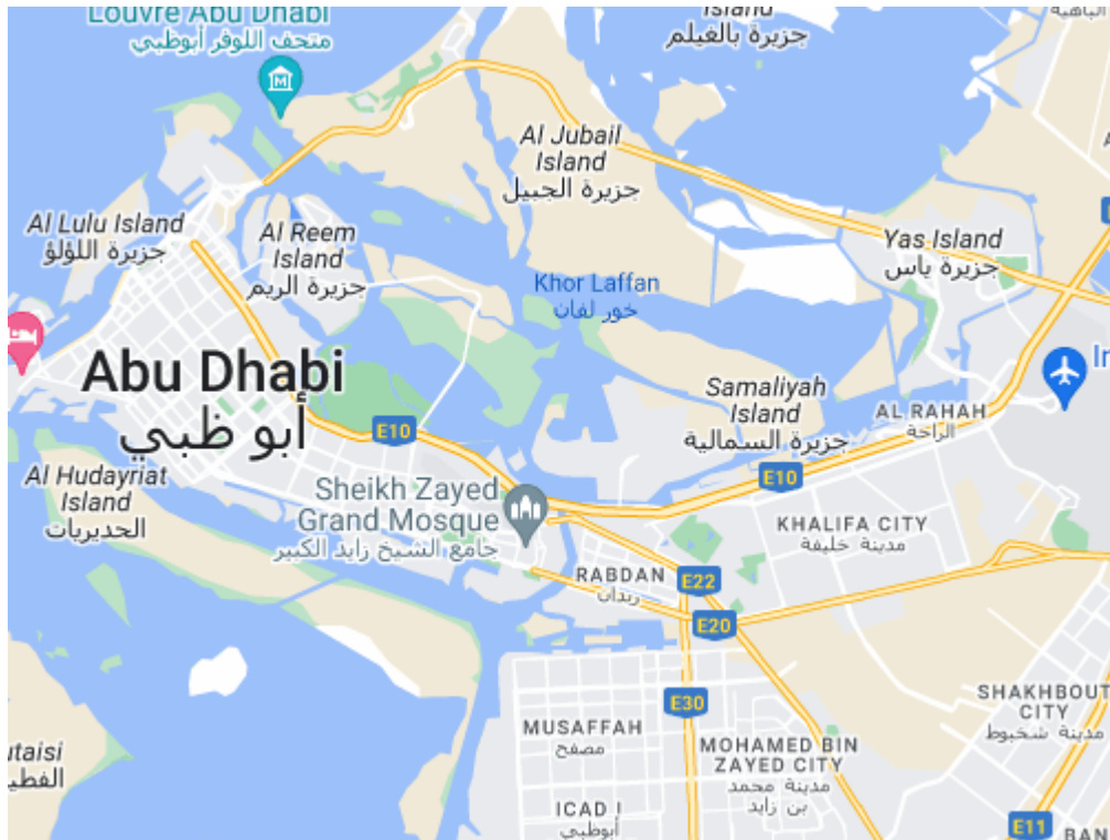
Directions on Google maps

- Description: Al Bahar Towers is a development in the emirate of Abu Dhabi consisting of two 29-storey, 145m – high towers. It is located at the intersection of Al Saada and Al Salam Street in Abu Dhabi City, the capital of the United Arab Emirates, at the eastern entrance. One tower houses the new headquarters of the Abu Dhabi Investment Council (ADIC), an investment arm of the Government of Abu Dhabi. The other serves as the head office of Al Hilal Bank, a progressive and innovative Islamic Bank. The distinguishing aspect of the towers is their protective skin of 2,000 umbrella-like glass elements that automatically open and close depending on the intensity of sunlight.