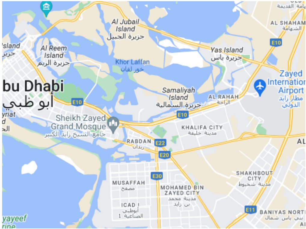
Directions on Google maps