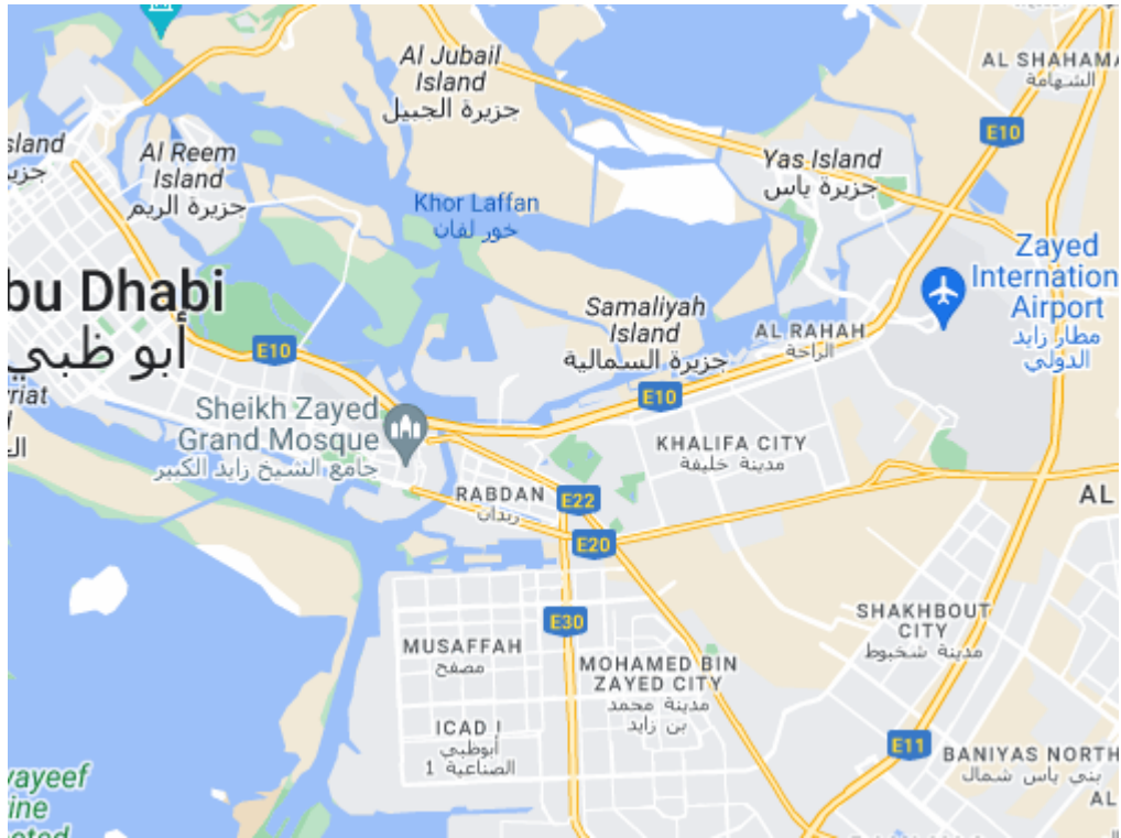
Directions on Google maps