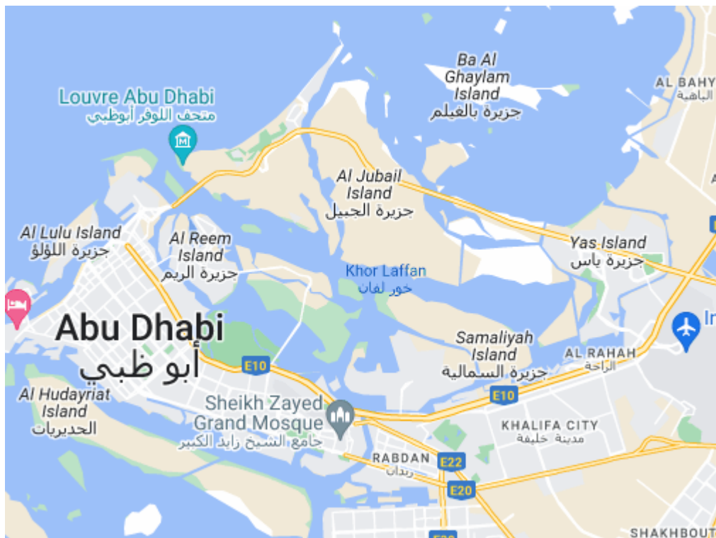
Directions on Google maps

- Description: The Louvre Abu Dhabi is an art museum located on Saadiyat Island in Abu Dhabi, United Arab Emirates. It runs under an agreement between the UAE and France, signed in March 2007, that allows it to use the Louvre's name until 2037, and has been described by the Louvre as "France's largest cultural project abroad. It is approximately 24,000 square metres (260,000 sq ft) in size, with 8,000 square metres (86,000 sq ft) of galleries, making it the largest art museum in the Arabian peninsula. Artworks from around the world are showcased at the museum, with stated intent to bridge the gap between Eastern and Western art. During the initial Concept Design phase in 2006-2007, Jean Nouvel and his team designed the museum as a "seemingly floating dome structure"; its web-patterned dome allowing the sun to filter through. The overall effect is meant to represent "rays of sunlight passing through date palm fronds in an oasis. The total area of the museum will be approximately 24,000 square metres (260,000 sq ft). The permanent collection will occupy 6,000 square metres (65,000 sq ft), and the temporary exhibitions will take place over 2,000 square metres (22,000 sq ft)