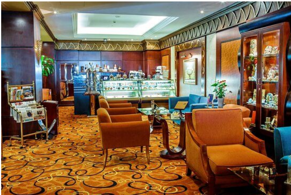
Cafe Mozart, Abu Dhabi-Dubai Road (E 10 Road - Abu Dhabi, United Arab Emirates)

- Address: Cafe Mozart, Abu Dhabi-Dubai Road (E 10 Road - Abu Dhabi)