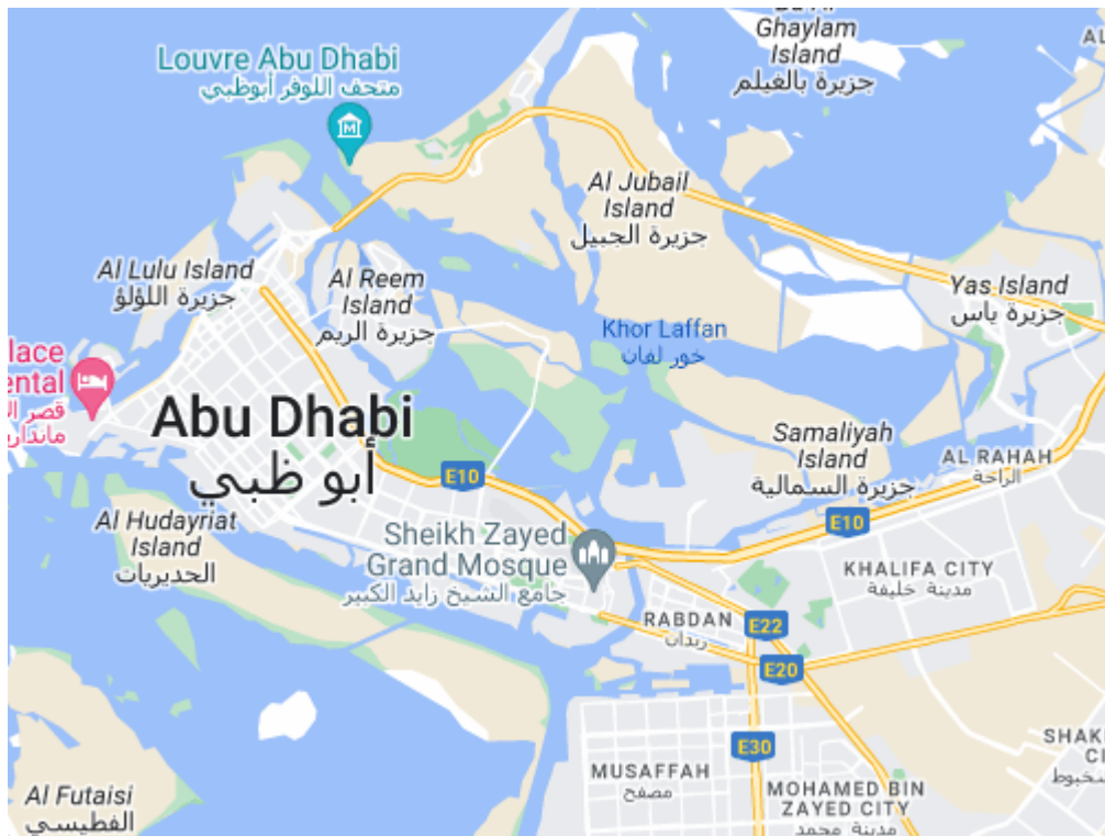
Directions on Google maps

The New Abu Dhabi Cultural Center is a dynamic hub of artistic expression and cultural exploration in the heart of the city. Boasting state-of-the-art facilities and a diverse range of programs, the center offers a vibrant platform for both local and international artists to showcase their talents. Visitors can immerse themselves in a rich tapestry of performances, exhibitions, and workshops, spanning various art forms such as music, dance, theater, and visual arts. Additionally, the center serves as a catalyst for cross-cultural dialogue and understanding, fostering connections between people from different backgrounds and traditions. With its innovative programming and inclusive approach, the New Abu Dhabi Cultural Center is a beacon of creativity and diversity in the region.