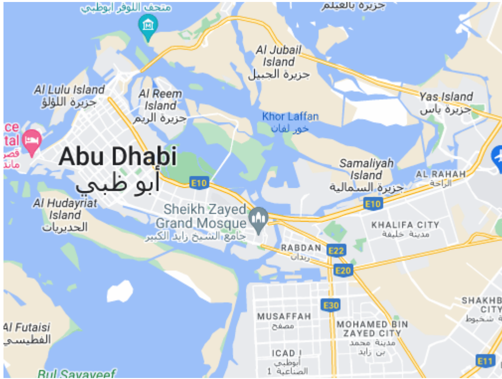
Directions on Google maps