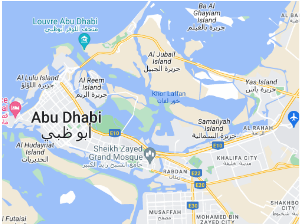
Directions on Google maps