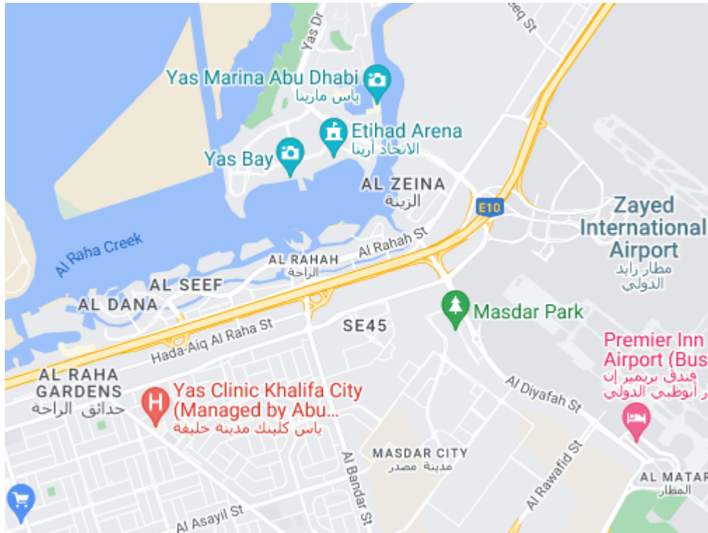
Directions on Google maps