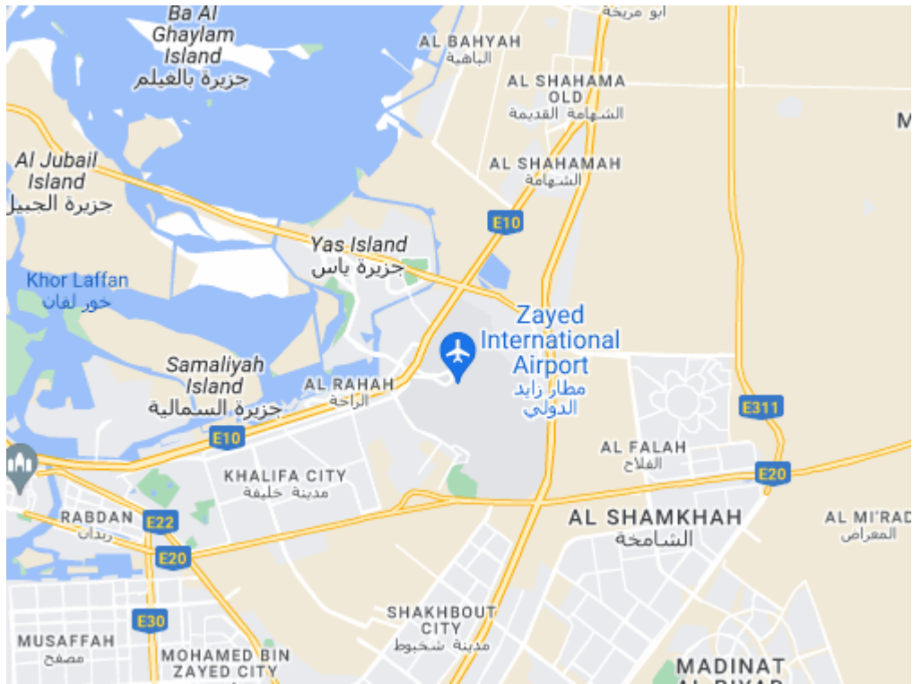
Directions on Google maps