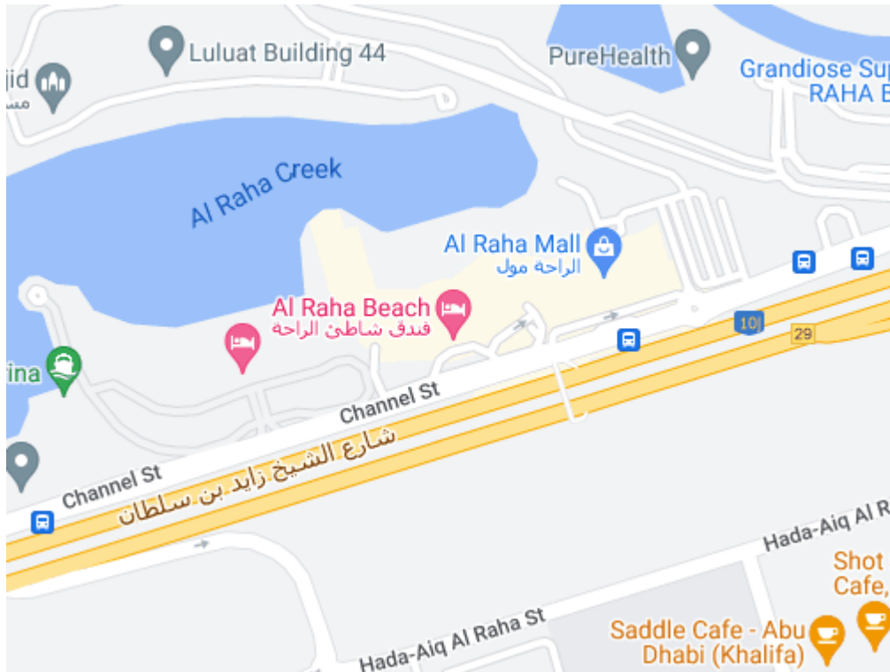
Directions on Google maps

- Cuisine: Desserts, Cake, Bakery, Coffee, Drinks, Lunch. This lofty Abu Dhabi Cafe maintains Al Raha Beach Hotel's tradition of elegance with traditional daily English and Colonial Afternoon Tea. Chocolate high-tea is served daily, featuring a selection of delicate pastries, warm scones with jam, finger sandwiches, and exquisite fine teas.